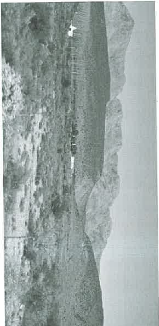
Figure: 4.2.5 A typical rural view in the Kannaland LM

The risk of event-related disasters and civil unrest is very low, due to the rural nature and general low population density, of the communities in the LM.